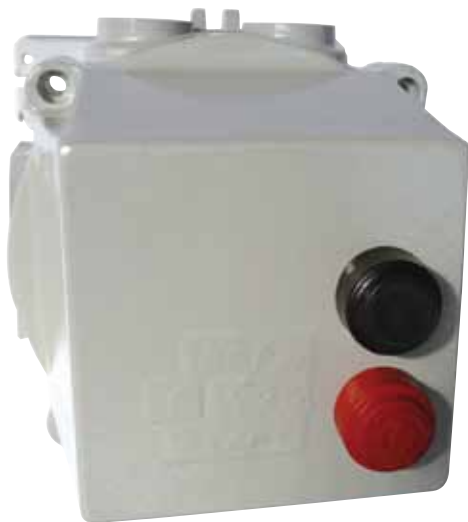
Ex d IIC Version