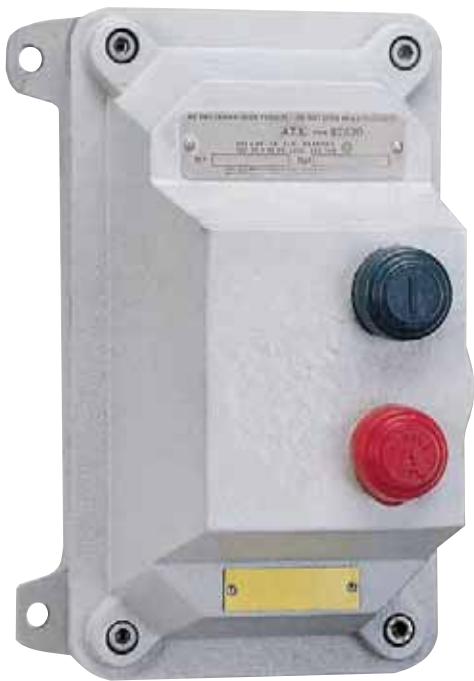
Ex d IIB Version